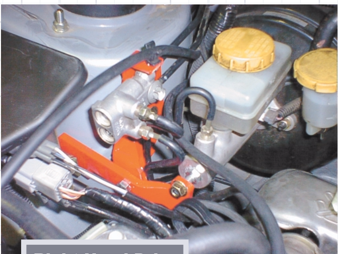
Right Hand Drive