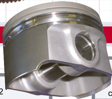
Part No: SUWE122 Set of 4

Available for Stroker or standard capacity (2l).