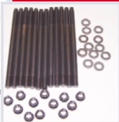
Kit Part No: SWE115A