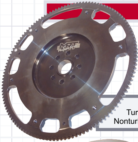
Part No: Turbo MUSSE119B Nonturbo MUSSE119D