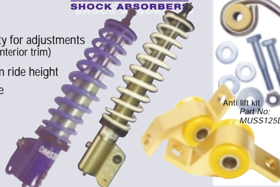
Anti lift kit Part No: MUSS125D

Designed and engineered to be 'outback' tough. Performance suspension components.