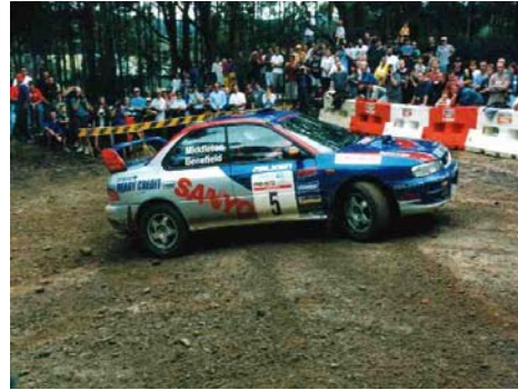
Subaru WRX Group A at Popular spectator point Gosford 2001

Their debut ARC event was the Forest Rally in Western Australia where the unique "ball bearing roads" led to a stream of costly punctures, however the team completed a steep learning curve. In the Asia Pacific round in Canberra, the team took a conservative approach looking for a solid finish. Despite two punctures they managed a number of top ten stage times to finish in the top twenty.