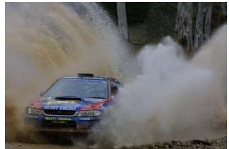
Coopers pale ale Rally 2001