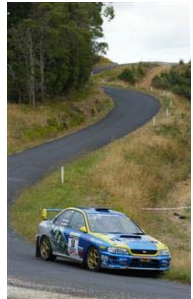
Coming 10 th in Toll / Ipec rally Tasmania 2003