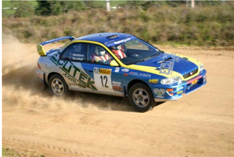
Winning at Bega, State rally Ch/Ship 2003

EcuTeK - MTQ Turbo's - Falken Tyres - Momo by Autotek - Shannon's Insurance Whiteline- Filter Mag - GFB - BOC Gasses - Premier Panel www.MRTally.com.au Phone: (02) 9809 2110 Fax: (02) 9809 2286 info@MRTally.com.au