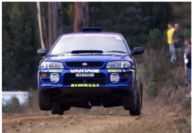
Subaru WRX Group N Driven by Cody Crocker Saxon Safari rally tasmania