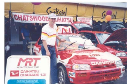
Rally car display Sydney