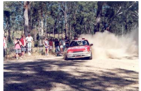
Charade G102 Group A