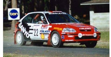
Honda Group A F2 Coffs Harbour 1997