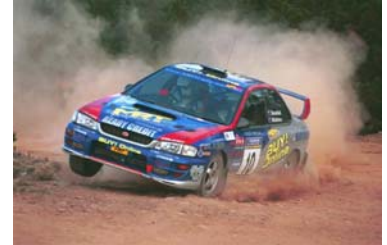
Rally Canberra 2001