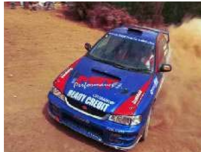
Subaru WRX Group A

Late 1995 and all 1996 the MRT crew established their new customer car division for road and rally. Growing from the original production of the rally Charade, it is now a huge success and highly regarded both nationally and internationally as one of essential ports of call when modifying specialty performance cars (especially the Impreza WRX which can often be spotted in 'MRT Enhanced' mode).