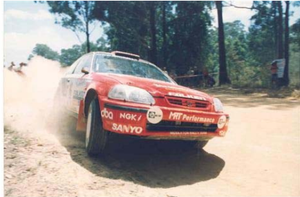
Honda Civic EK F2