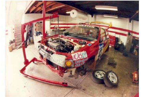
Car Preparation at MRT Performance